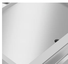
Plate welded to hob, thus guaranteeing a wider cooking zone and preventing the accumulation of dirt.

The plates tilt 10 mm towards the front of the appliance, optimising flow of fat into the drip drawer.